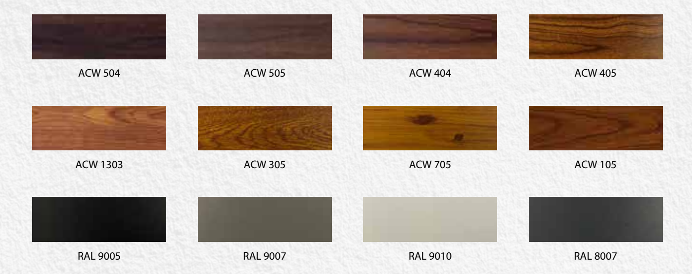
Explore Many More Colors for Your Perfect View!